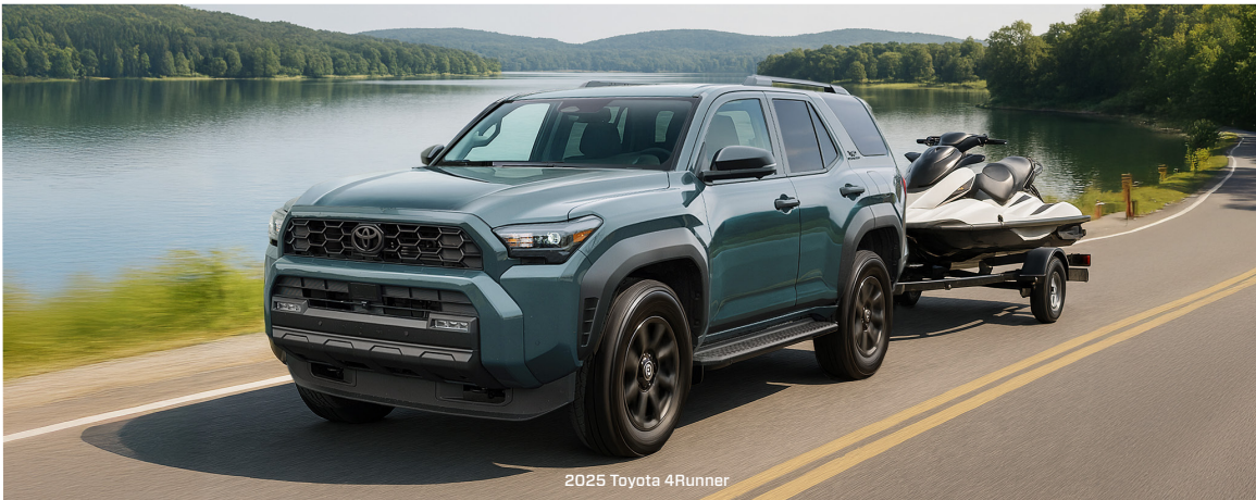
2025 Toyota 4Runner