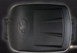
On-board air compressor